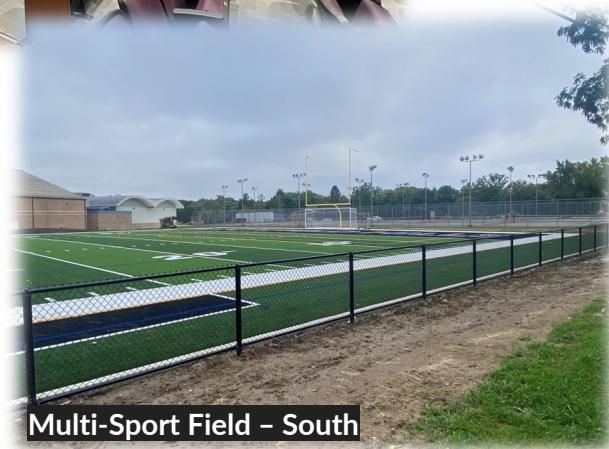
Multi-Sport Field - South