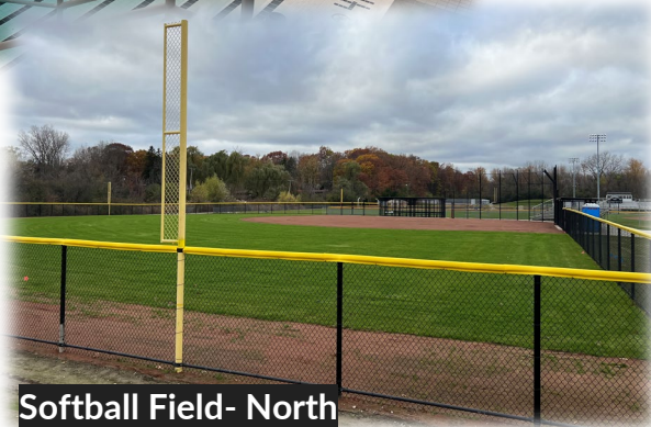
Softball Field- North