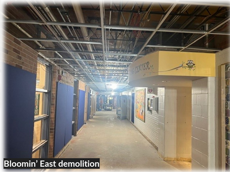
Bloomin' East demolition