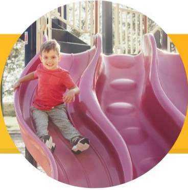
Before and After School Care