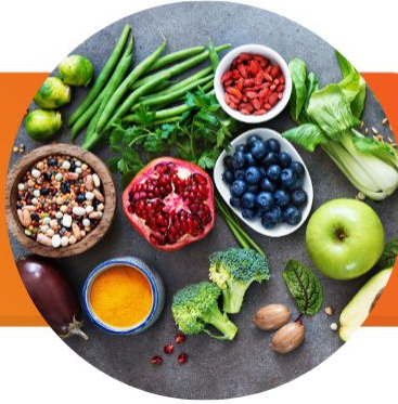
Hot Lunch Program