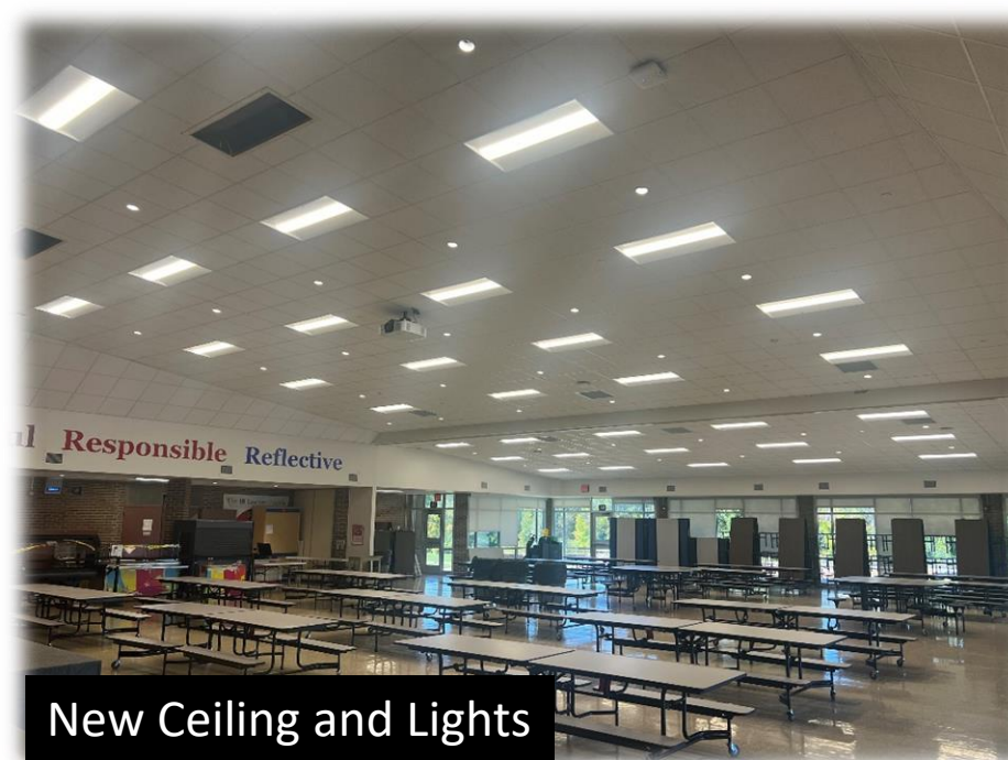
New Ceiling and Lights