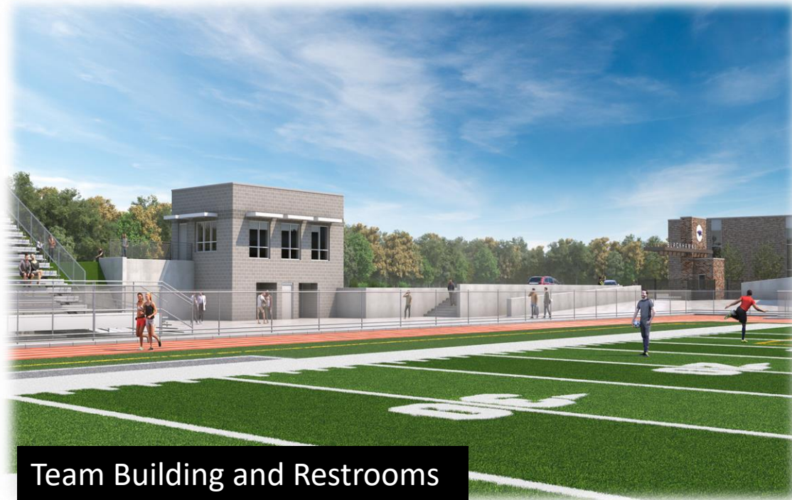
Team Building and Restrooms