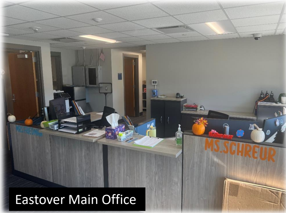
Eastover Main Office