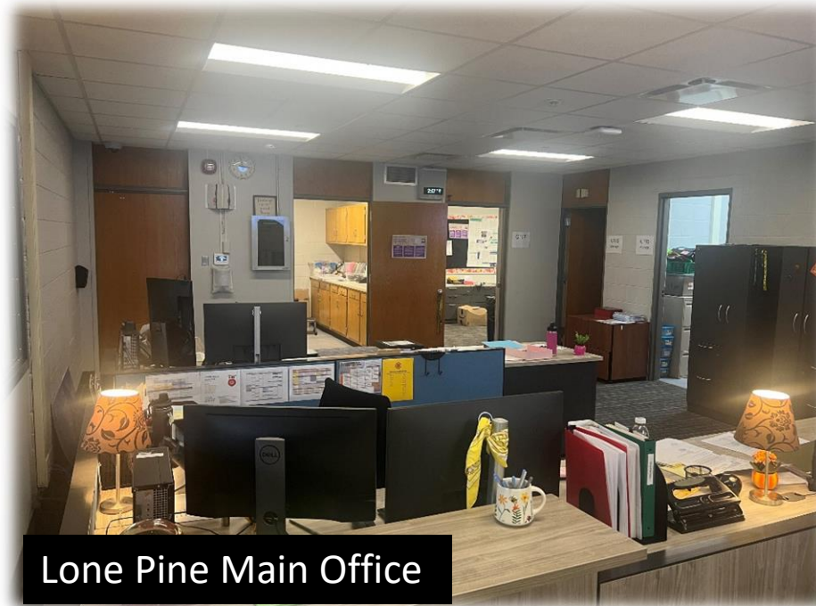
Lone Pine Main Office