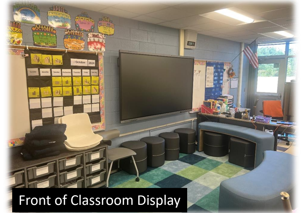
Front of Classroom Display